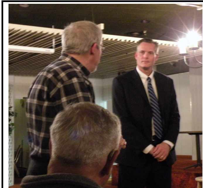
25TH LDD SEND OFF DINNER MAIN SPEAKER MARK LINDQUIST PIERCE COUNTY PROSECUTOR ANSWERS QUESTIONS

READ ALL ABOUT WHAT IS HAPPENING , WHAT DID HAPPEN, MINUTES PLUS UPCOMINGS ON PAGE 2 AND - - - - - PAY YOUR 2010 DUES TODAY! SEE PAGE 8.