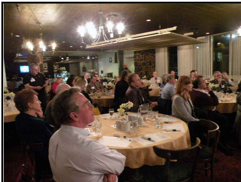
THE CROWD AT 25TH LDD SEND OFF DINNER